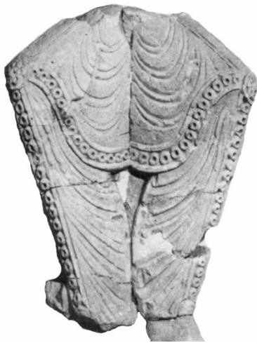
Fig. 2 - Carved stucco relief portraying a sovereign, found at Qaṣr al-Ḥayr al-Gharbī, 727/ 728, National Museum of Damascus (after Schlumberger 1986, pl. 64).