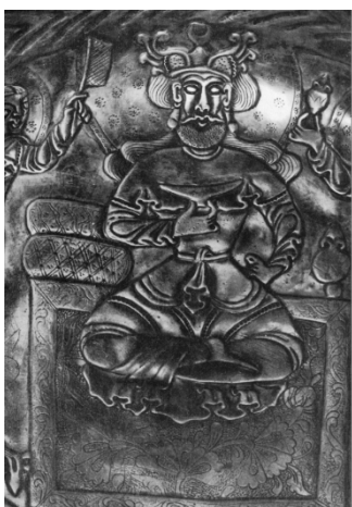
Fig. 8 - Silver plate depicting a hunting sovereign, allegedly from Marw, 8 th -9 th century, Hermitage State Museum, Saint Petersburg (after Marshak 1986, fig. 29, detail).