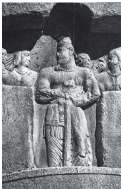
Fig. 7 - Naqsh-i Rostam, rock relief portraying Bahrām II (276-293) standing (after Ghirshman 1962, fig. 213, detail).