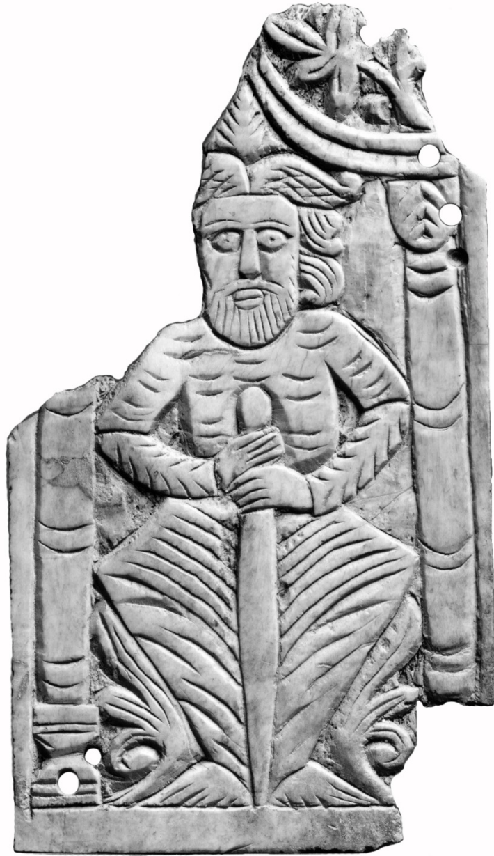
Fig. 1 - Carved ivory plaque depicting a seated sovereign, possibly from Egypt, 7 th -8 th century, The Walters Art Gallery, acc. no. 71.62 ( http://art.thewalters.org/detail/8959/seated-king ).