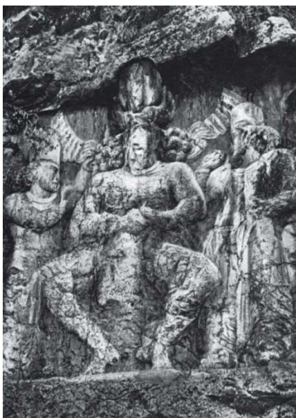
Fig. 6 - Naqsh-i Bahrām, rock relief portraying Bahrām II (276-293) enthroned (after Ghirshman 1962, fig. 214, detail).