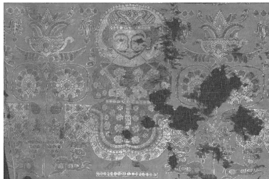
Fig. 3 - Samitum-woven silk textile depicting a seated sovereign, possibly made in Iran or Central Asia, 7 th -8 th century, The David Collection, Copenhagen, acc. no. 23/2011 ( www.davidmus.dk/en/collections/islamic/materials/textiles/art/23-2011 , detail).