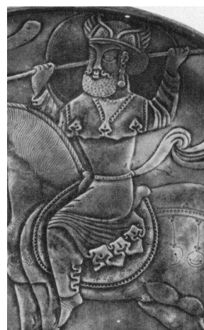
Fig. 9 - Silver plate depicting a banqueting sovereign, allegedly from Marw, 8 th -9 th century, Hermitage State Museum, Saint Petersburg (after Marshak 1986, fig. 31, detail).