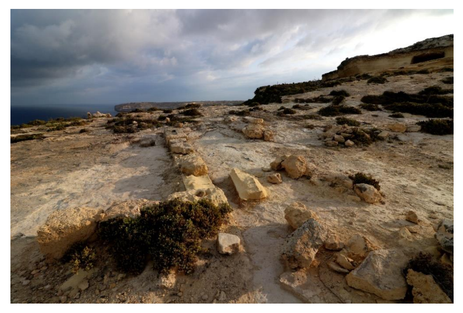
Fig. 4 - The Temple of Astarte and the altar on the lower terrace, from south.

Fig. 3 - Ras il-Wardija. The cave complex on the upper terrace (after Spagnoli 2022b, fig. 2).