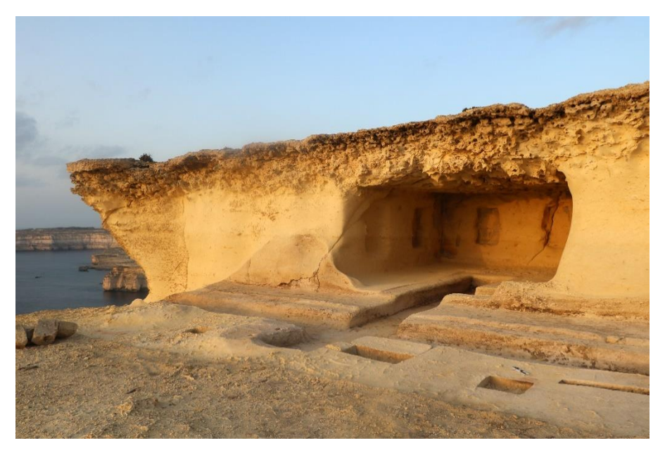
Fig. 3 - Ras il-Wardija. The cave complex on the upper terrace (after Spagnoli 2022b, fig. 2).