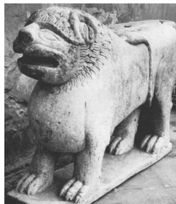
Fig. 5 - Siponto cathedral (Apulia), marble lion originally supporting a chair (ca.1050; after Belli D'Elia - Garton 1975, ill. on p. 65).