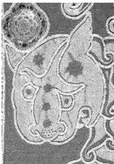
Fig. 6 - Vienna, Kunsthistorisches Museum, Kaiserliche Schatzkammer , Inv. no. XIII 14, mantle of Roger II of Sicily (1133-34), detail (after Scerrato 1979, fig. 149).