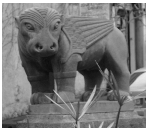
Figs. 9-10 - Ravello, details of the "Moresque Fountain" in the homonym square, lava stone statues by an artist from Catania replacing the original marbles from the second half of the 1970s (photos by the author, 2007).