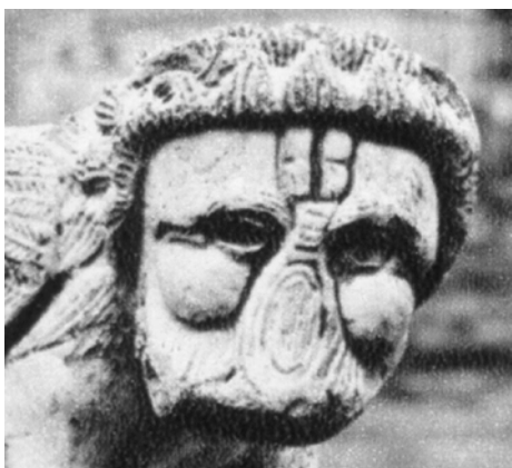
Fig. 4 - Detail of winged lion illustrated in fig. 2.