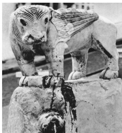
Figs. 2-3 - Ravello, the winged lion (left) and the winged bull (right) (probably 12 th century) of the “Moresque Fountain” in the homonym square before the statues were removed on 13 th September 1975 (after Gugliemi Fedeli 1972, figs. 30-31).