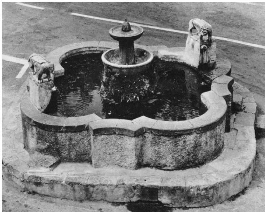
Fig. 1 - Ravello, the “Moresque Fountain” in the homonym square before the marble statues were removed on 13 th September 1975 (after Gugliemi Fedeli 1972, fig. 29).