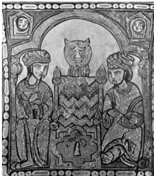
Fig. 7 - Palermo, The Cappella Palatina , panel of the wooden ceiling depicting two musicians in front of a fountain (ca. 1143; after Brenk 2010, Atlante / Atlas , II, fig. 832).