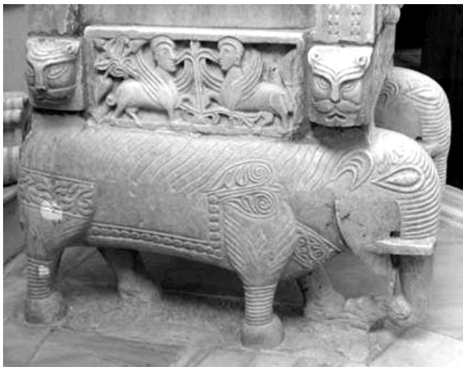
Fig. 8 - Canosa Cathedral (Apulia), a pair of marble elephants supporting the bishop's throne (1078-1089;).