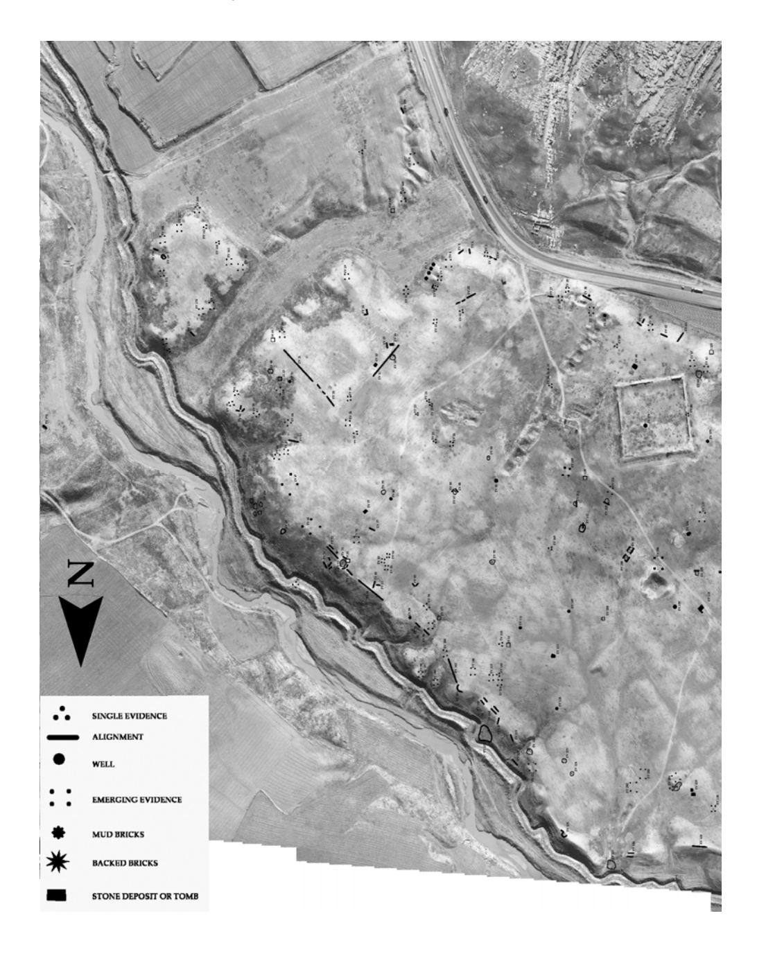
Fig. 2a: Estakhr: map of the evidences (eastern part; elaboration A. Blanco, L. Colliva).