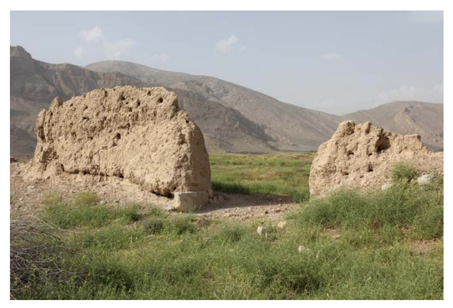
Fig. 3: Estakhr: access to the modern fort, the takht-e tavus , showing a re-employed squared stone (EST EV 46).