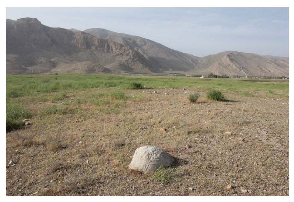
Fig. 4: Estakhr: worked stone found in the northern area of the site (EST EV 22).