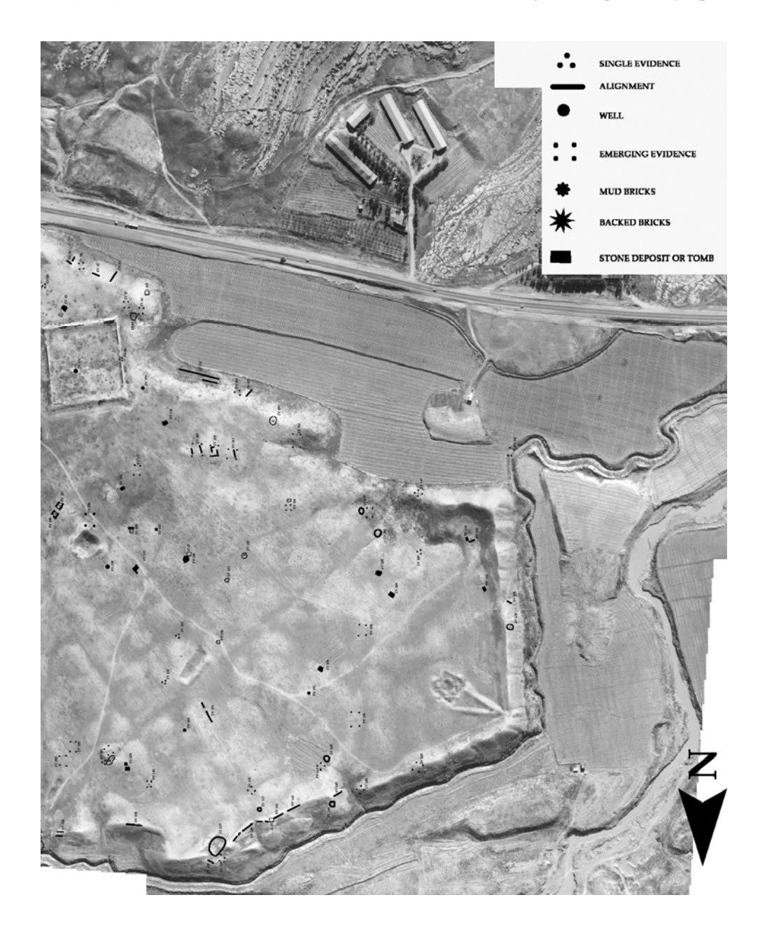
Fig. 2b: Estakhr: map of the evidences (western part; elaboration A. Blanco, L. Colliva).